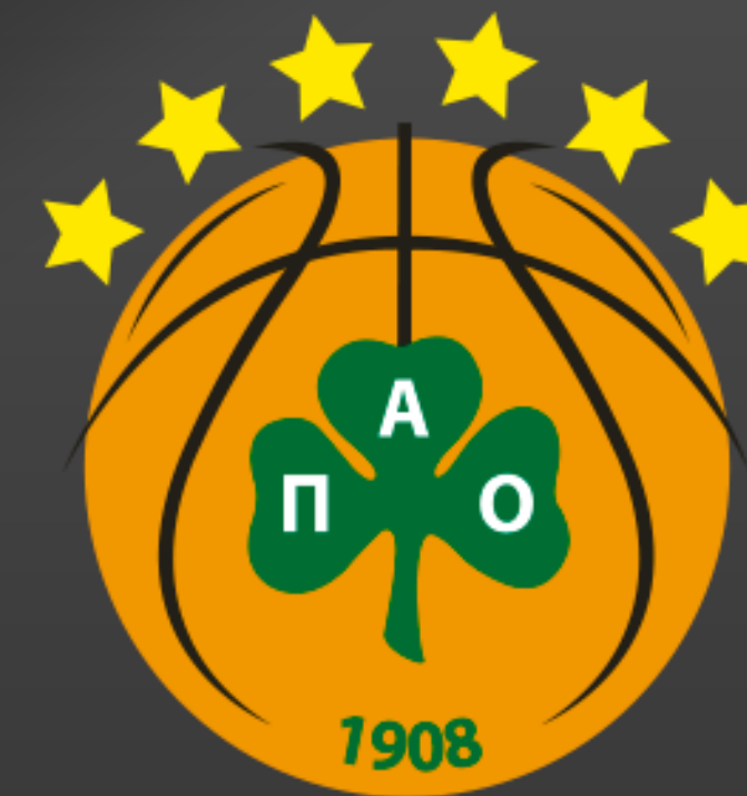
panathinaikos bc οπαρ